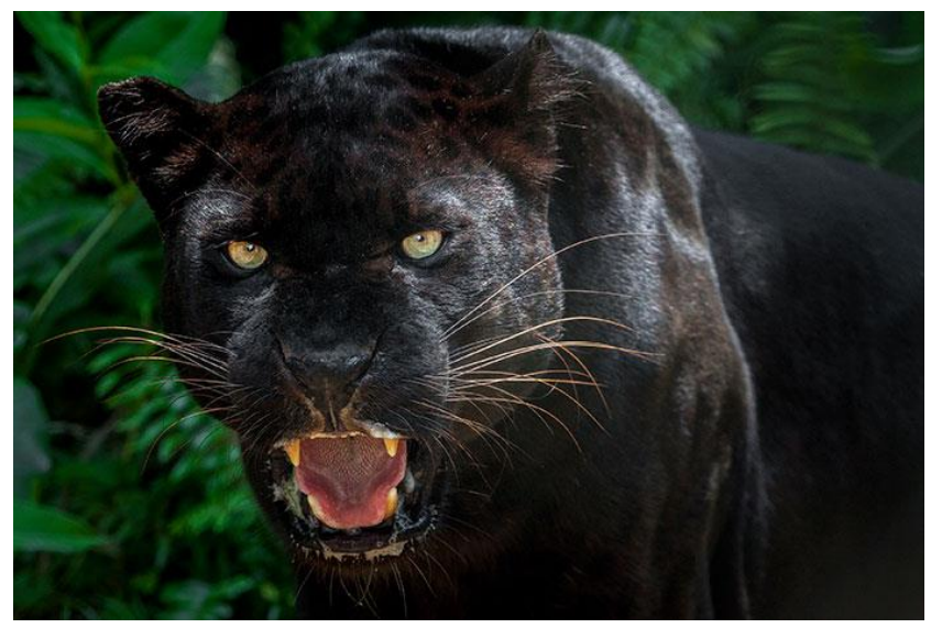
MASCOT Black Panther